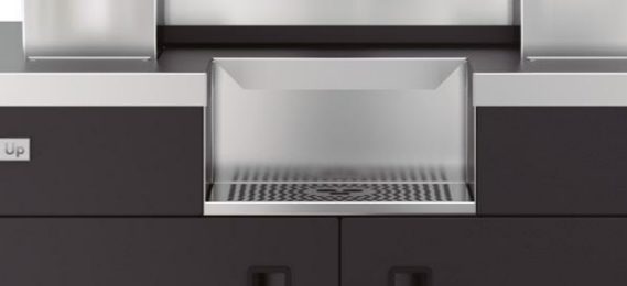
Speed Up All-in-one Model